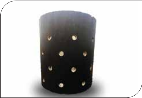
Septic tanks and Soak away