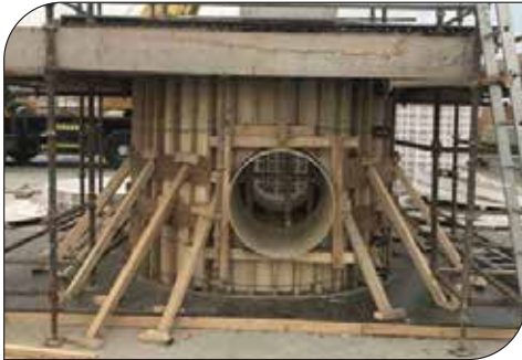
Manholes for Sewer and Drain