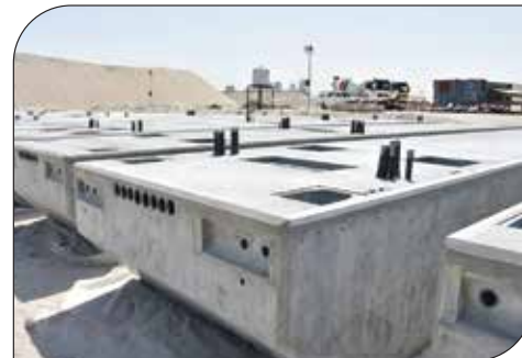
Pontoon & Buoy