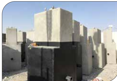
Street Light Foundations