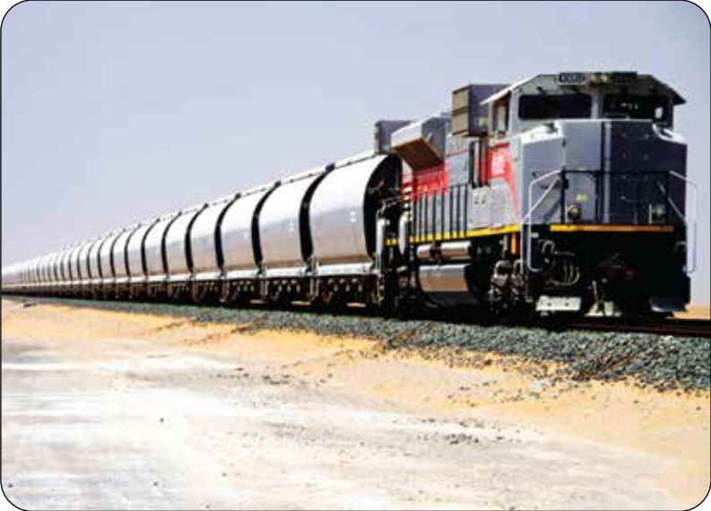
Concrete Products For Railway Projects