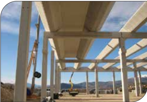
Columns and Beams