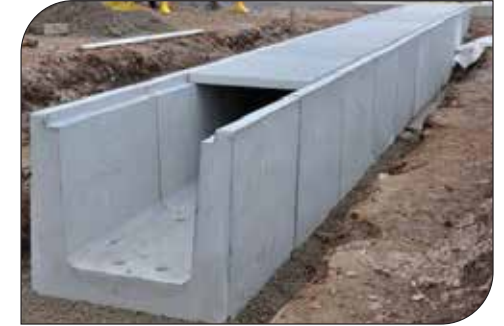
Troughs & Covers