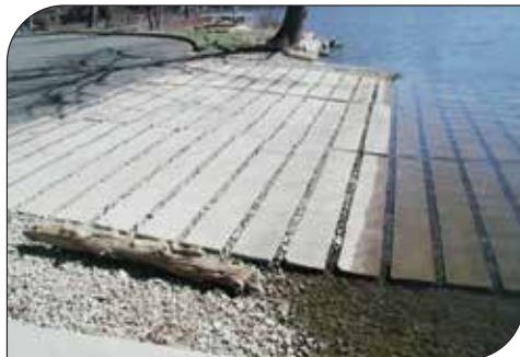
Boat Ramp Planks