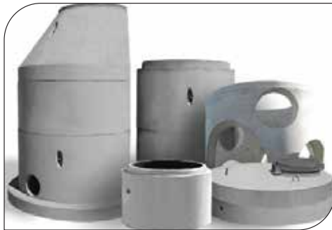
Manholes & Chambers