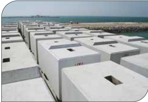
Quay Wall Blocks