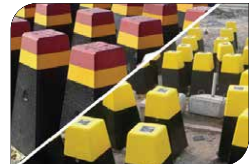
Route Markers & Bollards